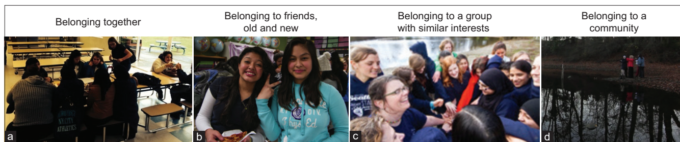
Figure 3: (a-d) Sense of belonging to each other as individuals, as whole group, and as part of larger community

her about what they did in the club, a new type of conversation that she felt proud about: