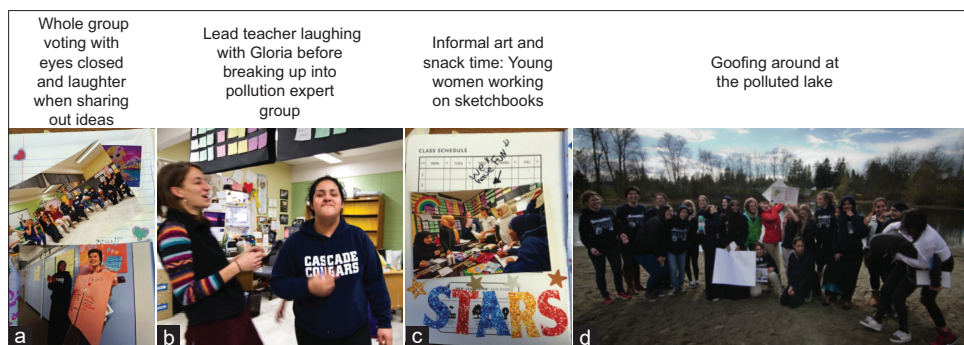
Figure 1: (a-d) Fun Times Throughout Science Club Activities