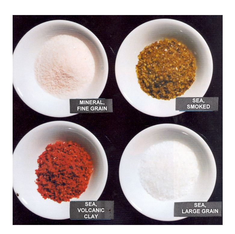
Kathimerini, 'K' Sunday Magazine Issue 17, pp. 28-29, September 2007.