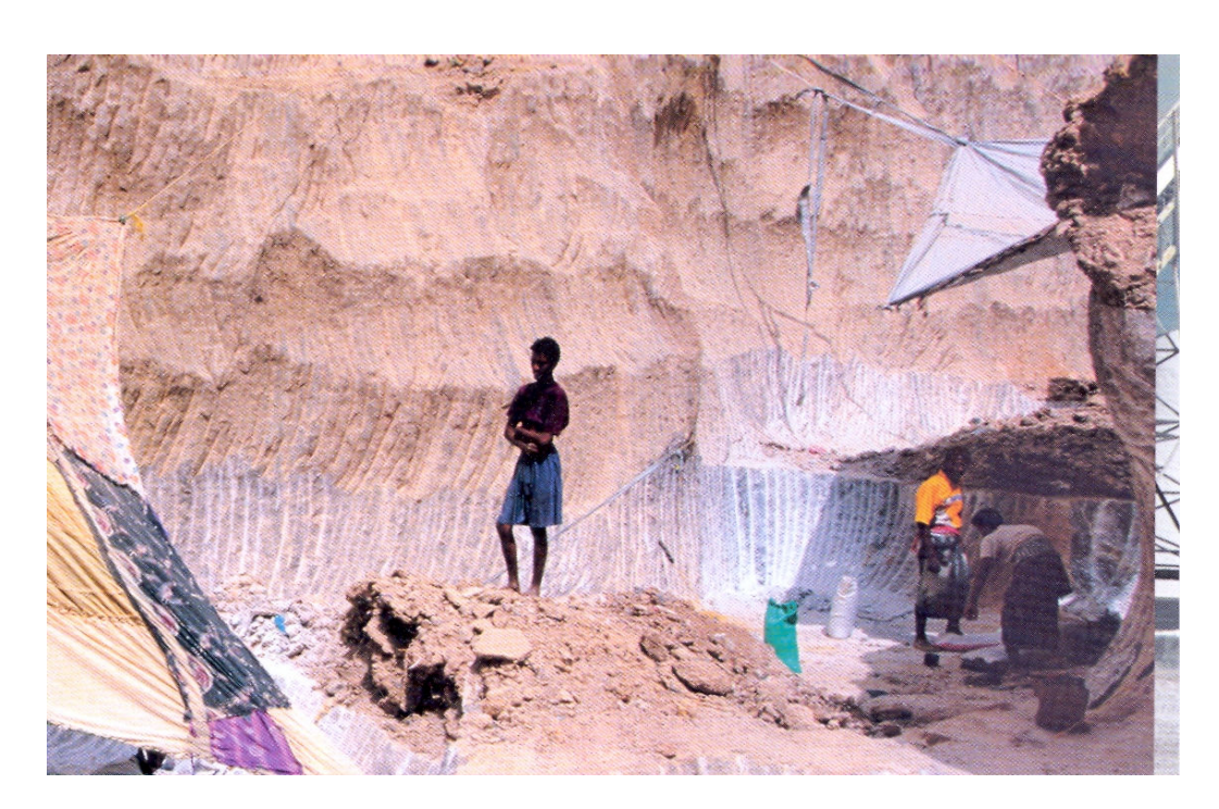
Workers mining salt in a salt mine in the Ayad area of Yemen. This salt mine has an age of at least 200 years.

The ancient salt lakes on the Greek island of Lemnos. The area is a Natura 2006 protected zone, and industrial production of salt is not allowed. During winter, the area offers refuge and food to thousands of flamingos. In the summer, local people wait until the so-called flower of sea forms, and collect it.