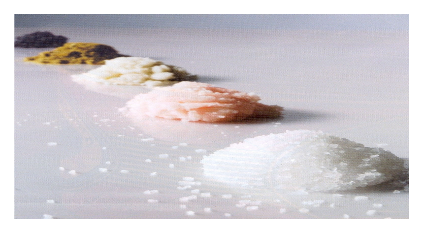
Kathimerini, 'K' Sunday Magazine, Issue 17, p, 40. September 2007.